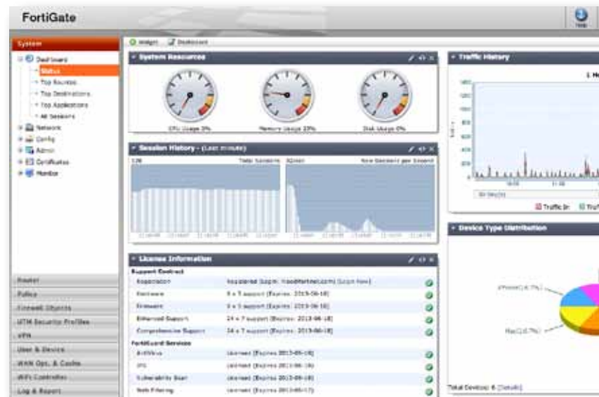
FortiOS Dashboard - Single Pane of Glass Management

Fortinet FortiCare support offerings provide comprehensive global support for all Fortinet products and services. You can rest assured your Fortinet security products are performing optimally and protecting your users, applications, and data around the clock.